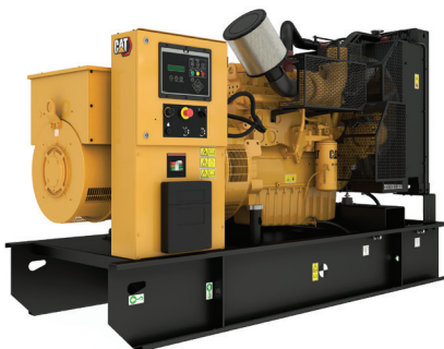
Image shown might not reflect actual configuration